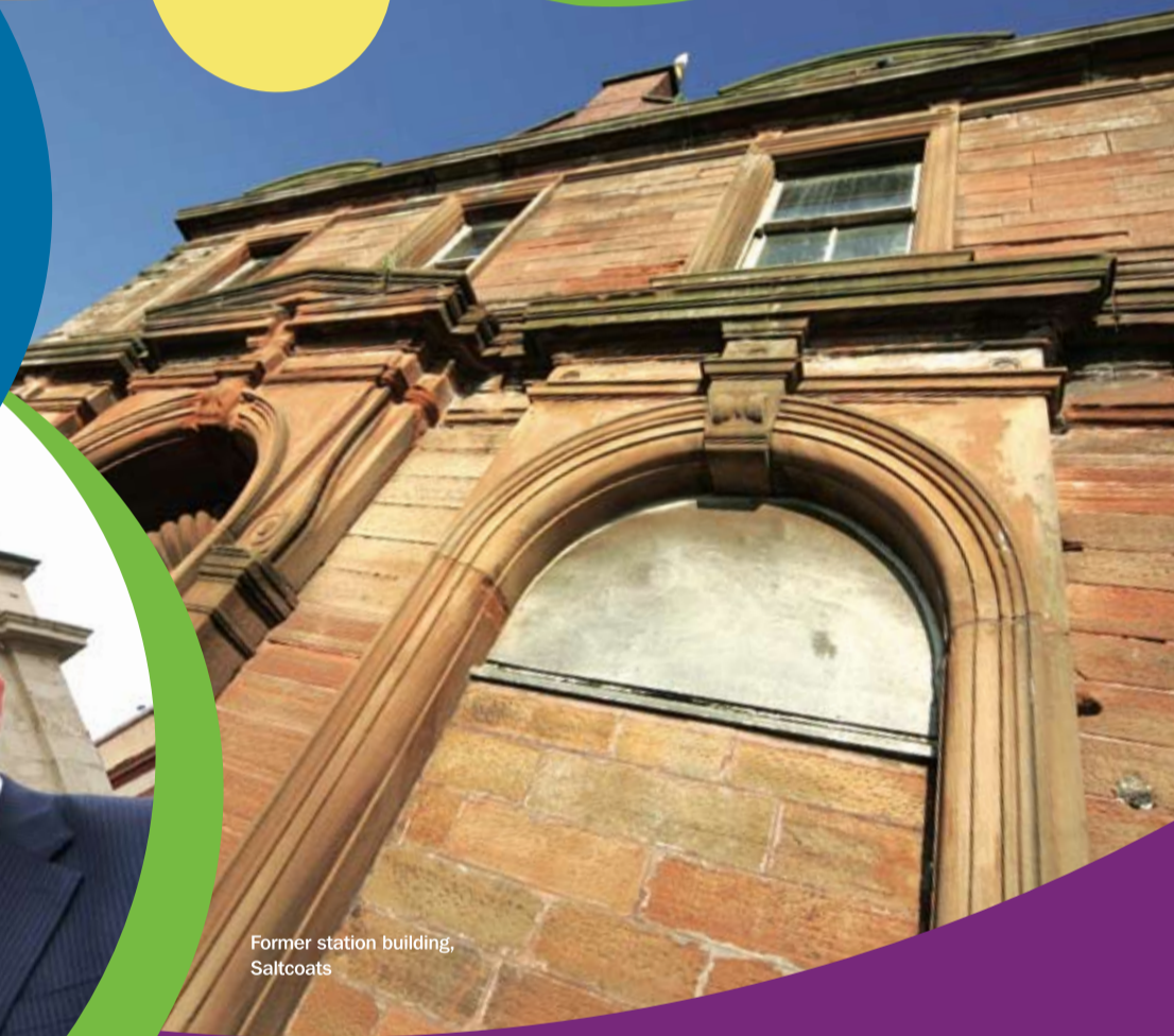
Former station building, Saltcoats

The £1.45m comes from the Scottish Government's new Town Centre Regeneration Fund which is making £60m available to projects across Scotland this year. The new funds make it possible to develop the former Jack Miller Hotel and the Harbour Bar in Ardrossan as well as the former station building in Saltcoats.